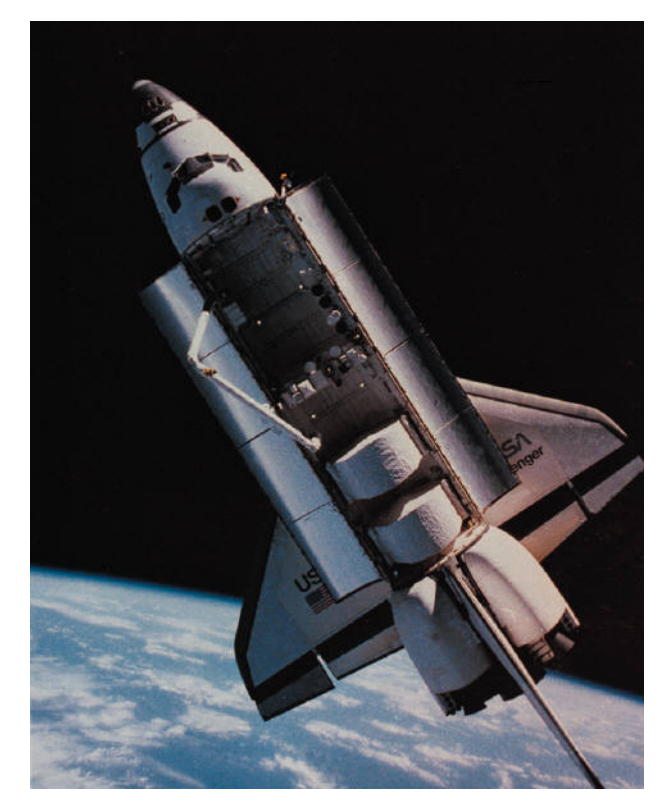
The Space Shuttle was not Sole Sourced!